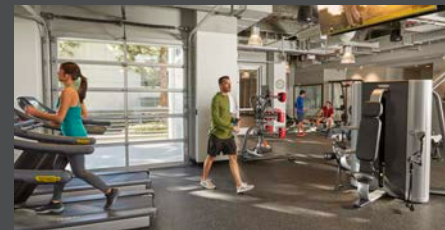
On-site indoor-outdoor fitness center with locker room