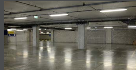
Ample Covered Parking