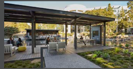
Beautifully landscaped park like setting with lake