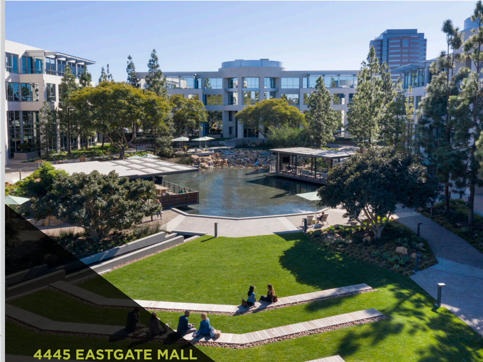
4445 EASTGATE MALL